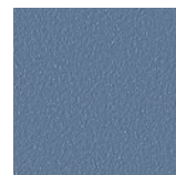
Blue RAL 5014