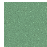
Salvia/Green RAL 6021