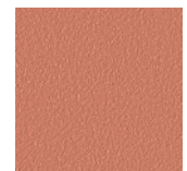
Terracotta RAL 3012