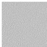
Light Grey NCS S 2500-N