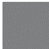
Grey NCS S 6500-N