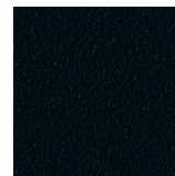
Black RAL 9005